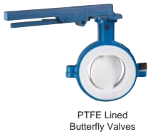
PTFE Lined Butterfly Valves