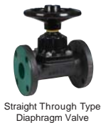
Straight Through Type Diaphragm Valve