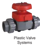
Plastic Valve Systems