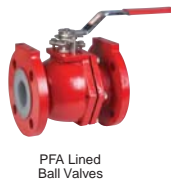
PFA Lined Ball Valves